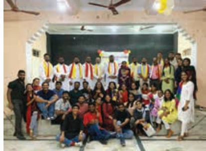
West Delhi Unit