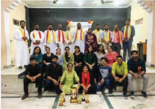
Mayur Vihar Unit