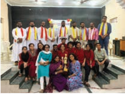
Dilshad Garden Unit