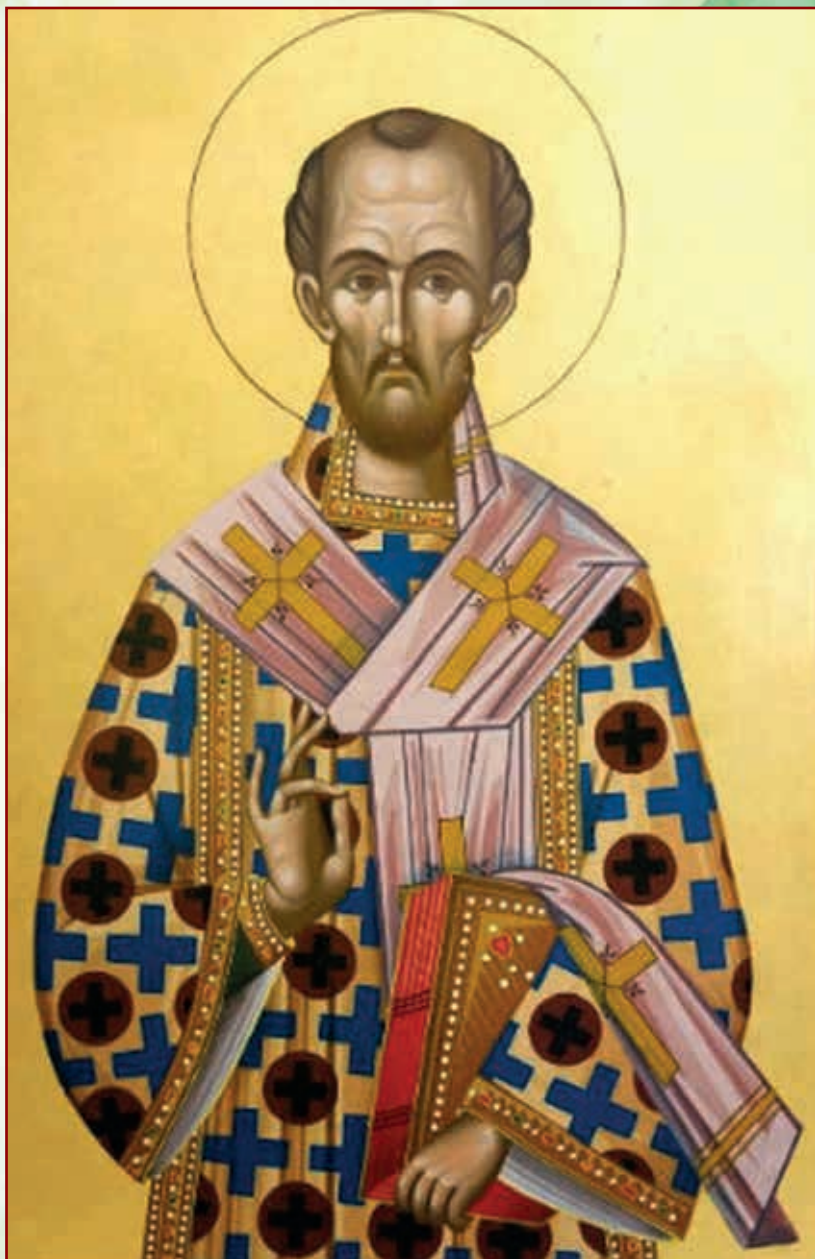
St. John Chrysostom