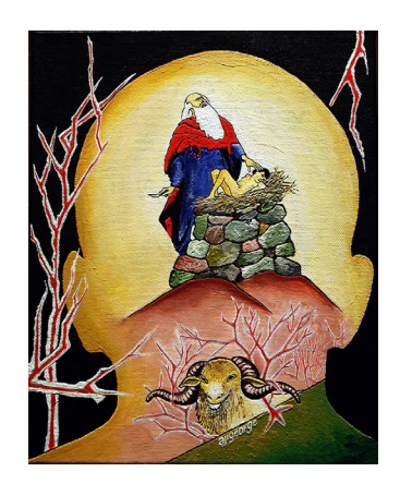
The Crucifixion of the Lamb to the Resurrection of the Ram