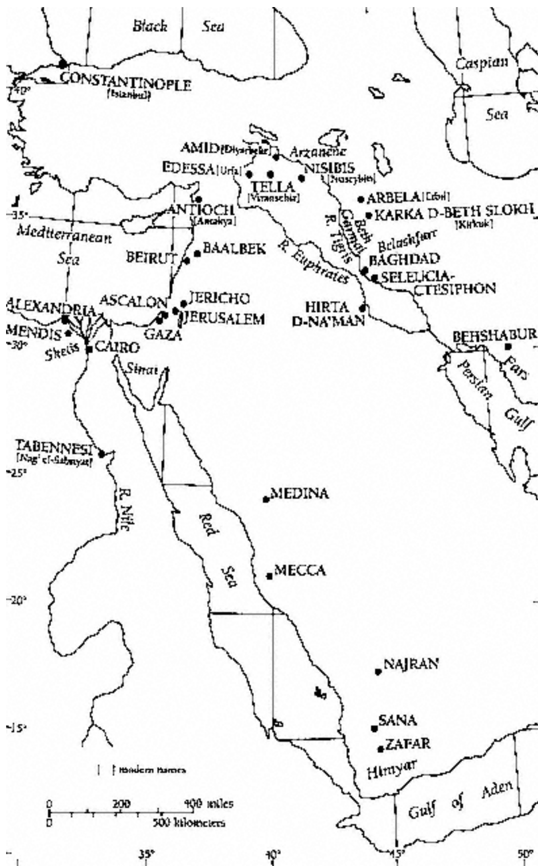
The Syrian Orient